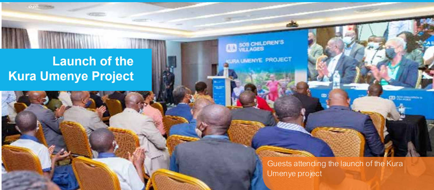
Guests attending the launch of the Kura Umenye project

According to the Integrated Household Living Condition Survey 6 (EICV 6); poverty, family conflicts, limited level of education and poor management of resources are major threats to child security and safety in their homes. These are root causes of child right violation and poor parenting skills in Rwanda. Until today, many children from broken families suffer from abuse, neglect, abandonment, drug abuse and child labor. In the worst case, they go to live on the streets and are at risk of developing mental-related issues.