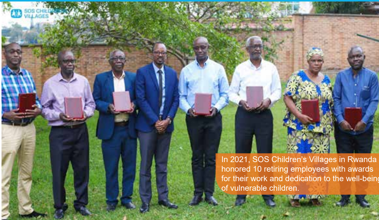
In 2021, SOS Children's Villages in Rwanda honored 10 retiring employees with awards for their work and dedication to the well-being of vulnerable children.