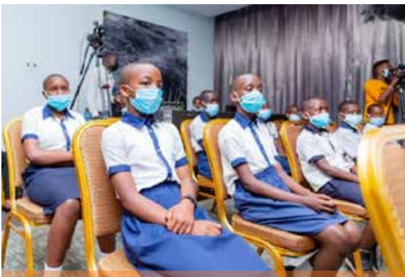
Child Rights Club Indashyikirwa from SOS school in Nyamagabe is composed of children aged 8 to 13 years living at SOS Children's Villages Gikongoro (Nyamagabe) and from the surrounding community. The Child Rights club presented a role play highlighting the problems of abandoned children in street situation.